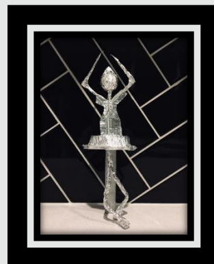
Anastasia T, 3AB